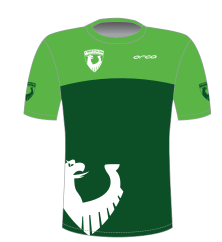
M Run short